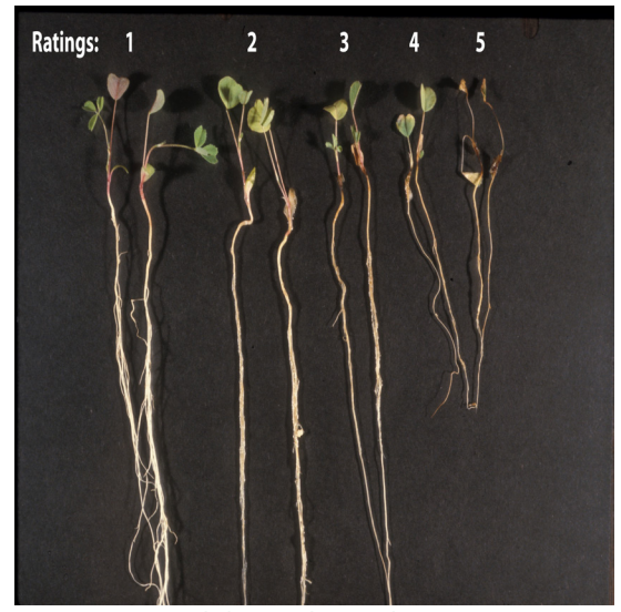
(Click to see larger photo.) Apahnomyces root rot ratings.

Values for resistant standards are percent of total plants in classes 1 and 2. Both Saranac and WAPH-1 must be used as race 2 susceptible checks.