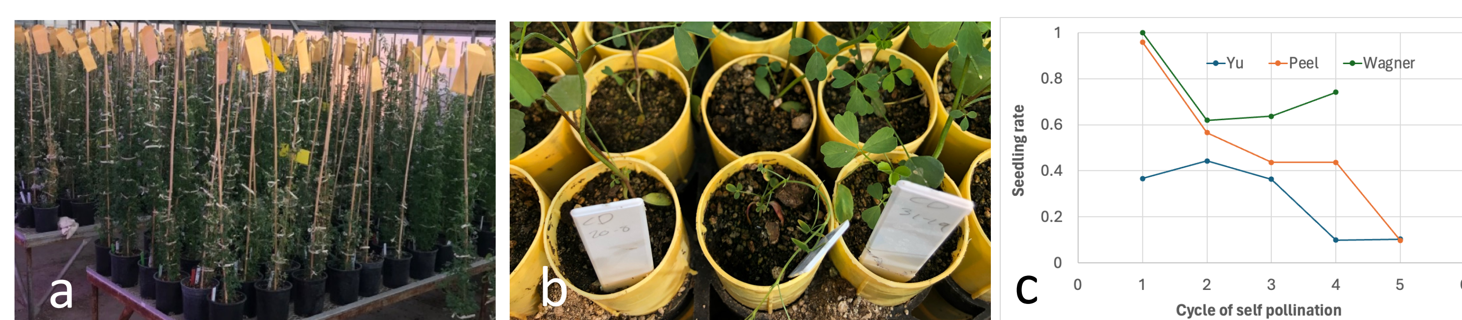
Figure 1. Display of plants at full (a)/early (b) develop stages and seeding plant rate across self cycles and programs. The plants at cycles 1 are established clones in Mike Peel and Stave Wagner programs. The rest are from seed, including Long-Xi Yu at cycle 1.